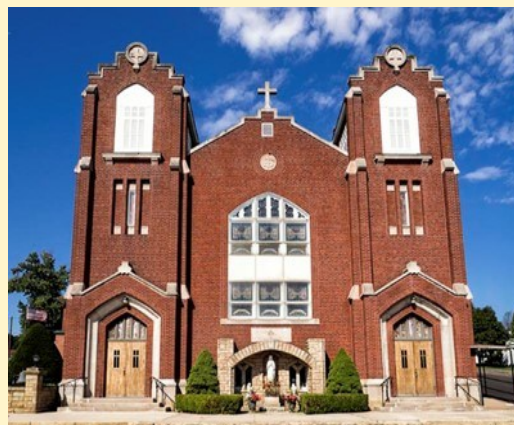
Immaculate Conception Mission Church

408 Stone Street · Osceola Mills, PA 16666