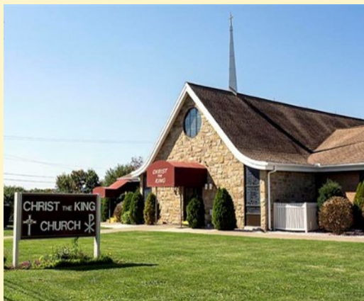
Christ the King Church